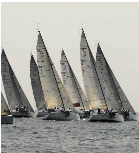
Mumm 30 fleet during CPYC's One Design Regatta