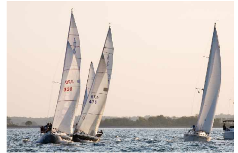
Wednesday Night racing

A big thanks to Washington Mutual (WaMu) - this year's spon-