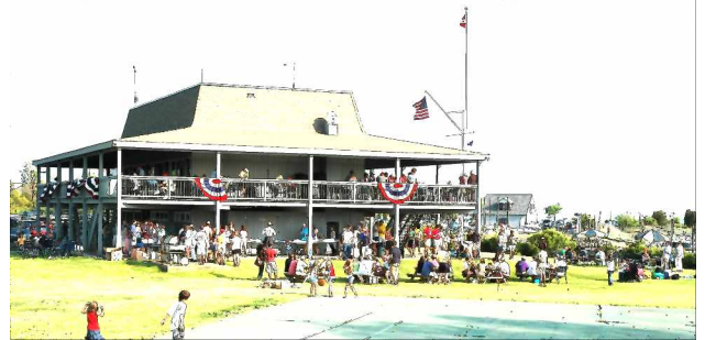
2007 Memorial Day Picnic at CPYC

The wrap up picnic was full of bright sunshine, a pleasant cooling breeze, camaraderie, family, friends, food, kids, games