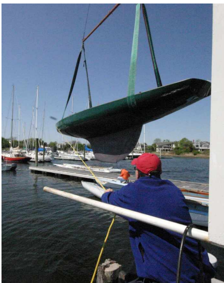
Atlantic launch day