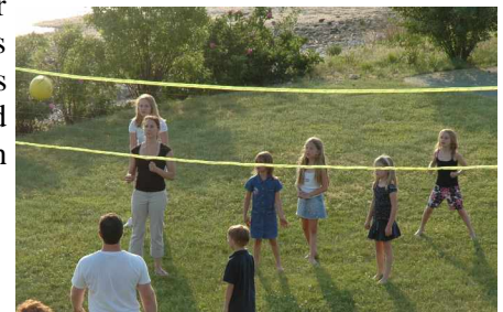
Volleyball on Memorial Day