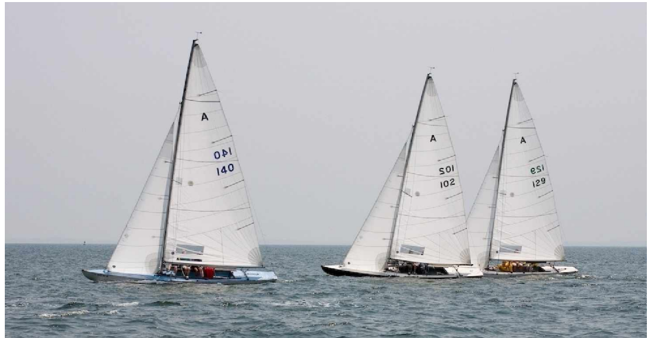
Atlantics 140, 102, and 129

Sunday the breeze kicked up from the east providing 15 – 20 knot winds and some serious chop. Chris Wittstock, in A25, ruled the day by sailing to victory in both races without ever looking back.