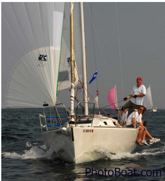
Revelation, looking well trimmed during the One Design Regatta